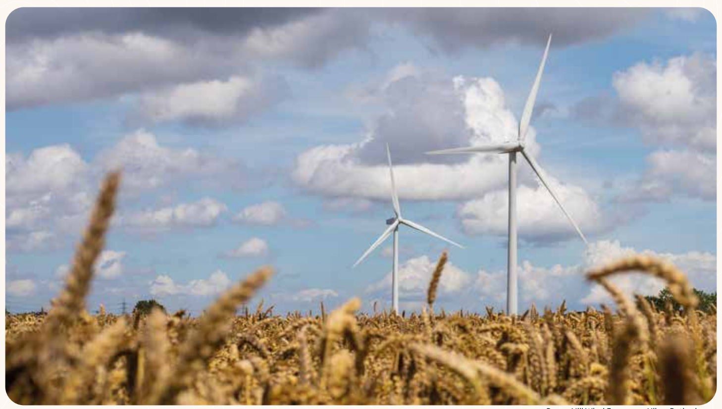
Penny Hill Wind Farm near Ulley, Rotherham