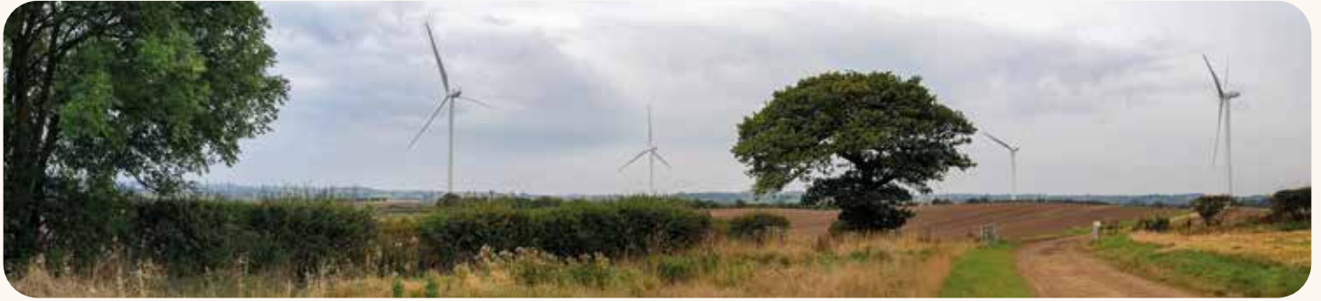
Lambs Hill Wind Farm near Stillington, Stockton-on-Tees