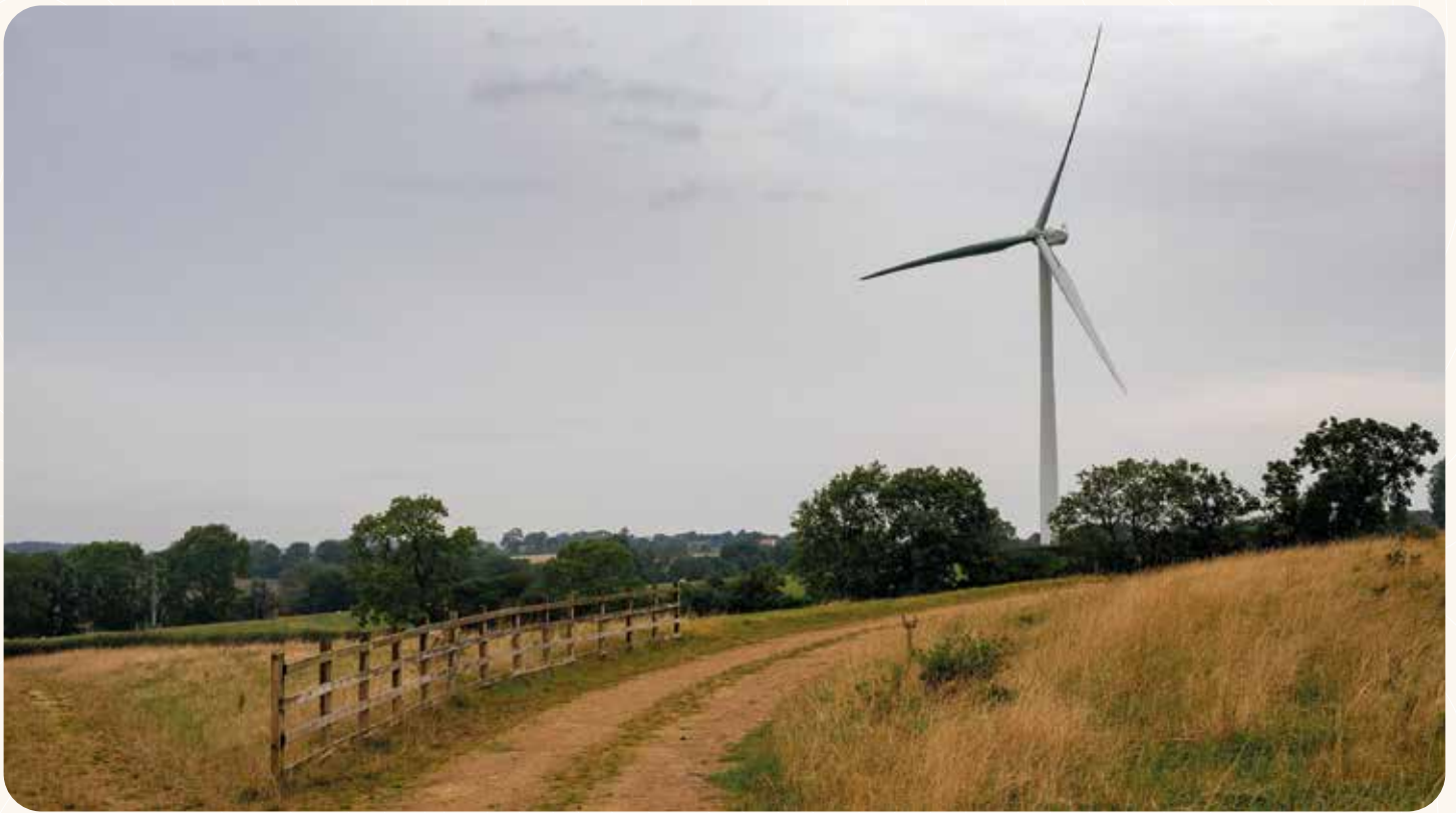
Lambs Hill Wind Farm near Stillington, Stockton-on-Tees