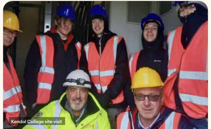
Kendal College site visit