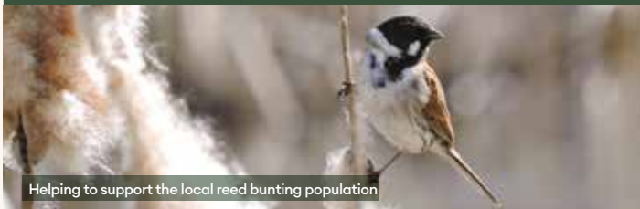
Helping to support the local reed bunting population